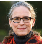
Carolyn Bourdeaux Georgia 07