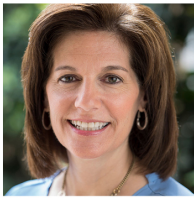
Catherine Cortez Masto Nevada Senate