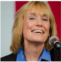
Maggie Hassan New Hampshire