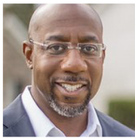
Rev. Raphael Warnock Georgia