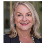
Susan Wild Pennsylvania 07