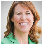
Cindy Axne Iowa 03