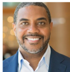
Steven Horsford Nevada 04