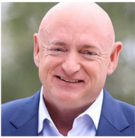
Mark Kelly Arizona

After competitive and expensive campaigns, these candidates need early money now to retain staff and discourage potential challengers.